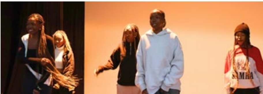
Move with the beat. Amapiano dancers bringing the energy to life!