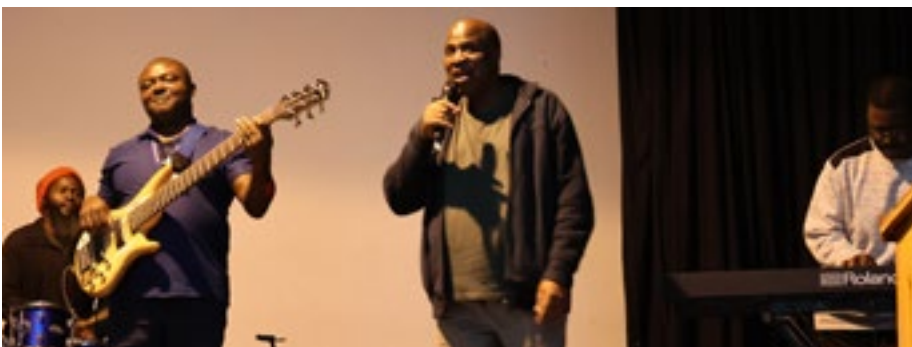
The band brought the rhythm and got the people moving.